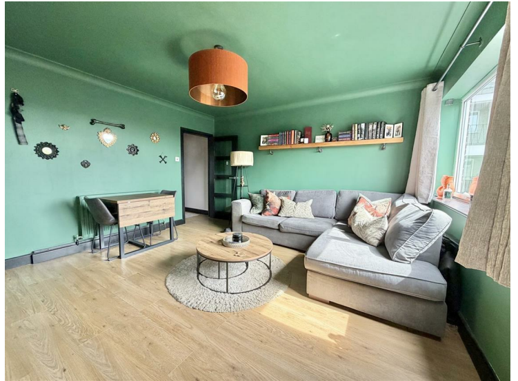
Lounge 13'6" x 13'5" (4.13 x 4.11)