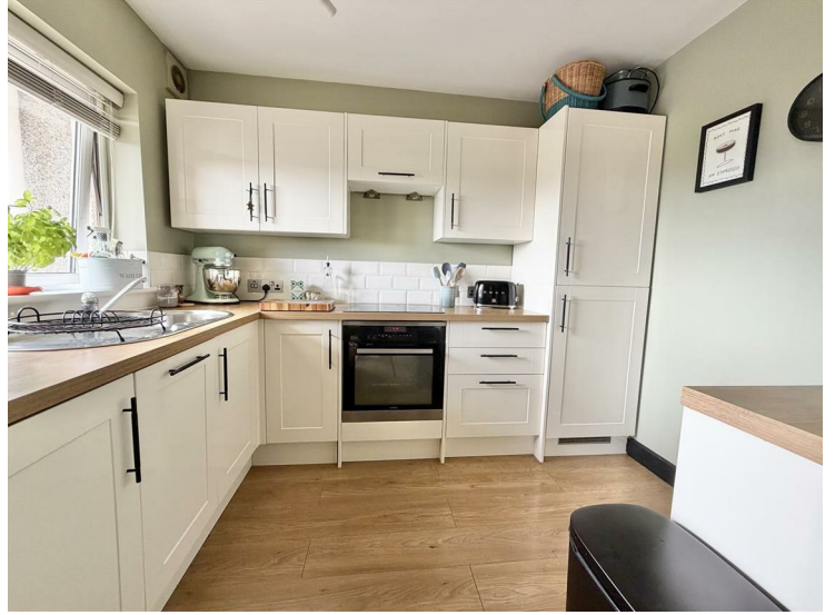
Kitchen 10'8" x 7'3" (3.26 x 2.23)