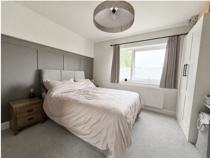
Bedroom 11'9" x 11'0" (3.59 x 3.37)